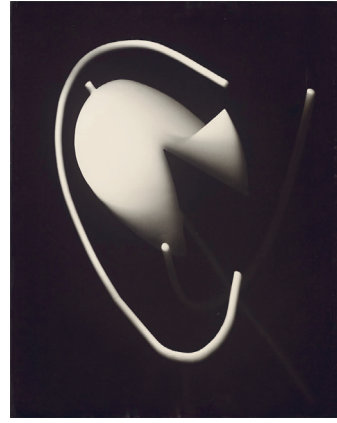
László Moholy-Nagy. Untitled. 1939. Vintage. Photogram. Unique work. Result: EUR 71,250*