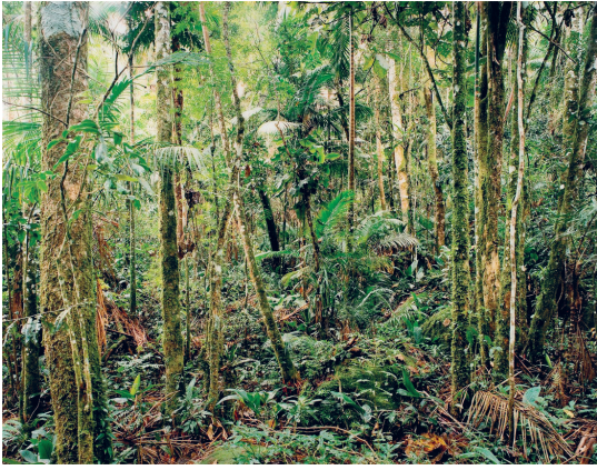
Thomas Struth. "Paradise 24, Sao Francisco de Xavier" Brazil. 2001. C-Print, Diasec. Result: EUR 95,000*