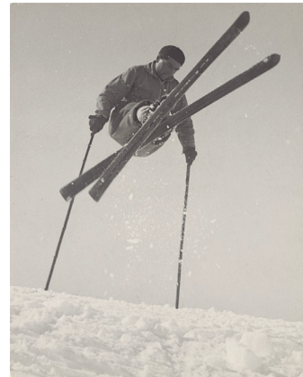
Martin Munkácsi. Ski Jump. Arlberg Ski School. 1930. Vintage. Gelatin silver print. Result: EUR 40,000*