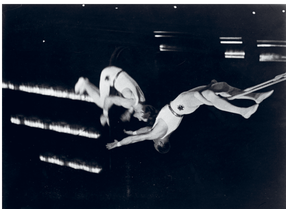
Umbo. The „3 Codonas“ at work. Circa 1932. Vintage. Gelatin silver print. Result: EUR 10,000*