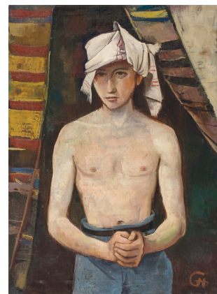
Karl Hofer. "Jüngling mit Kopftuch". Ca. 1924 Oil on canvas. 111 × 80 cm