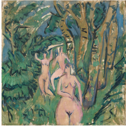
Ernst Ludwig Kirchner. "Akte im Wald" (Fehmarn). 1912 Oil on cotton. 51 × 50,5 cm