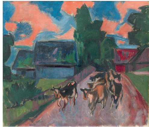
Hermann Max Pechstein. "Morgenrot". 1919 Oil on canvas. 69,5 × 80,5 cm