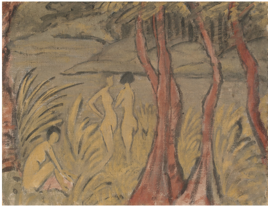
Otto Mueller. "Drei Badende und rotbraune Bäume". Ca. 1914 Distemper on Hessian. 66 × 85,5 cm