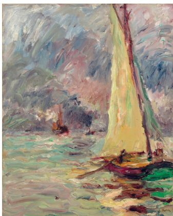
Emil Nolde. "Segelboot" (Hamburger Hafen). 1910 Oil on canvas. 70 × 56,5 cm