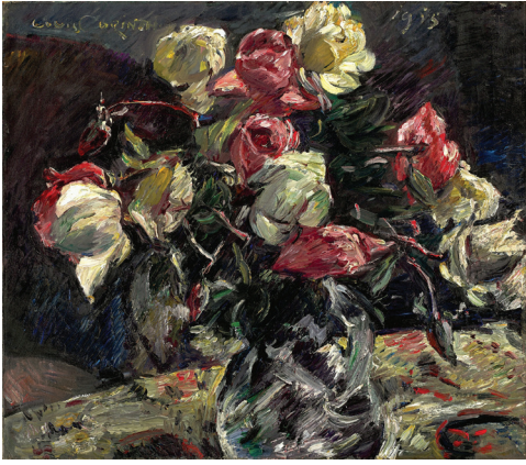
Lovis Corinth. "Helle Rosen". 1915 Oil on canvas. 54 × 62 cm