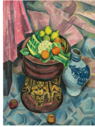
Hermann Max Pechstein. "Stilleben in Grau". 1913 Oil on canvas. 100 × 74,5 cm