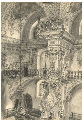
Adolph Menzel. Inneres der Stiftskirche zu Einsiedeln. 1881 Pencil on wove paper, laid down on Japan paper. 42 × 28.8 cm