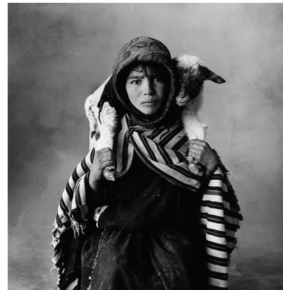
Irving Penn. "Young Berber Shepherdess, Morocco". 1971 Gelatin silver print, selenium toned, 1983. 39.6 × 38 cm