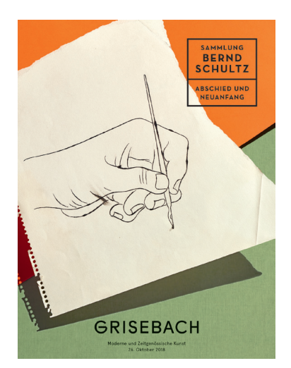
Bernd Schultz Collection III Modern and Contemporary Art Friday, 26 October 2018, 2 p.m.