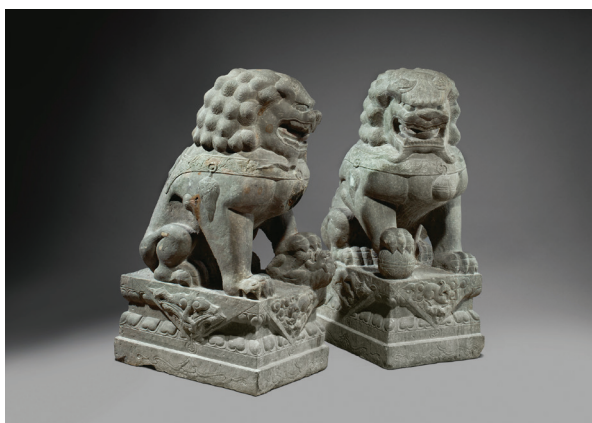
Chinese, Ming Dynasty. A pair of monumental guardian lions. 17th century. Grey limestone. Each approx. 87 × 32 × 52 cm