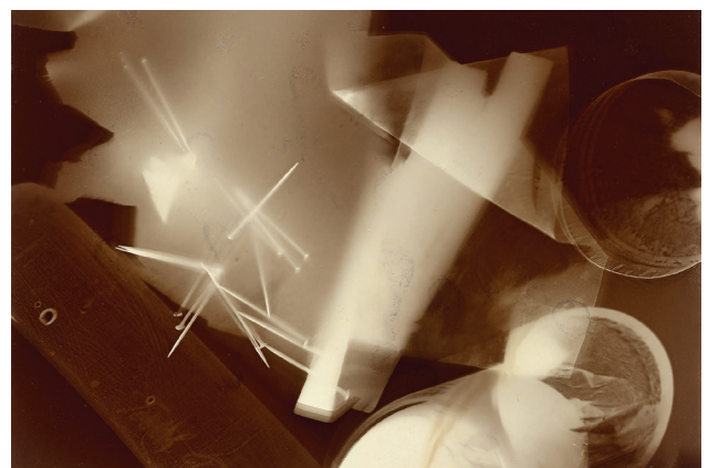
László Moholy-Nagy. Untitled. 1923/25. Vintage. Photogram. Unique work. 12.5 × 17.6 cm