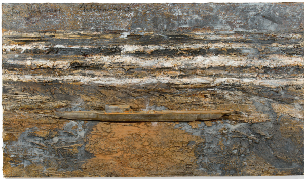
Anselm Kiefer. "für Velimir Chlebnikow". 2004/2005. Acrylic, oil, lacquer, resin, chalk, lead and mixed media on canvas. 190 × 330 cm