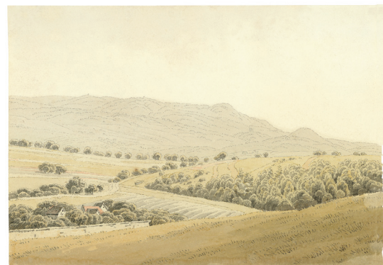
Caspar David Friedrich. "Mittelgebirgslandschaft". Ca. 1828. Watercolour over pencil on paper. 14.5 × 20.6 cm