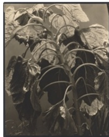
Edward Steichen. Sunflower. 1921. Vintage. Gelatin silver contact print. 24,5 x 19,4 cm