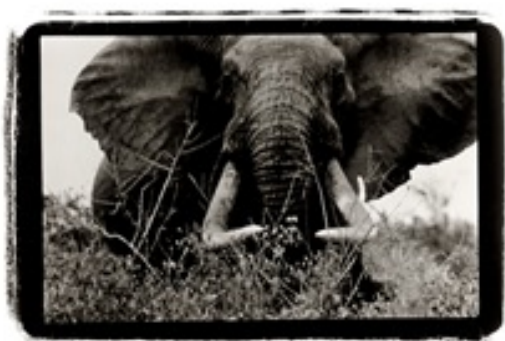
Peter Beard. „Large tusker“. 1965. Gelatin silver print, 1990s. 66,5 x 101,5 cm (81,2 x 116,5 cm). Unique work