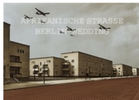
Thomas Ruff. „a.s.b.01“, from the series „l.m.v.d.r.“, 1999-2001. 2001. C-Print, Diasec. 100 x 137 cm. One of 5 editioned copies