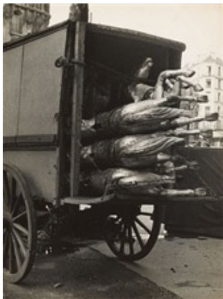
André Kertész. Chevaux de bois d'un carrousel démonté, Paris. 1929. Vintage or early gelatin silver print. 23,8 x 17,9 cm