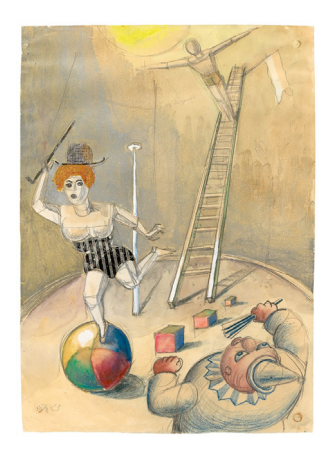
Otto Dix. "Zirkusscene". 1923 Mixed media on paper. Estimate EUR 200,000-300,000