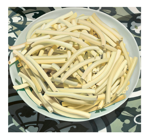
Karin Kneffel. Untitled. 2003 Oil on canvas. Estimate EUR 100,000–120,000