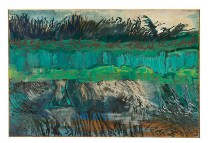
Per Kirkeby. Untitled. 2006 Oil on canvas. Estimate EUR 300,000-400,000