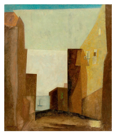
Lyonel Feininger. "Cammin". 1934 Oil on canvas. Estimate EUR 500,000-700,000