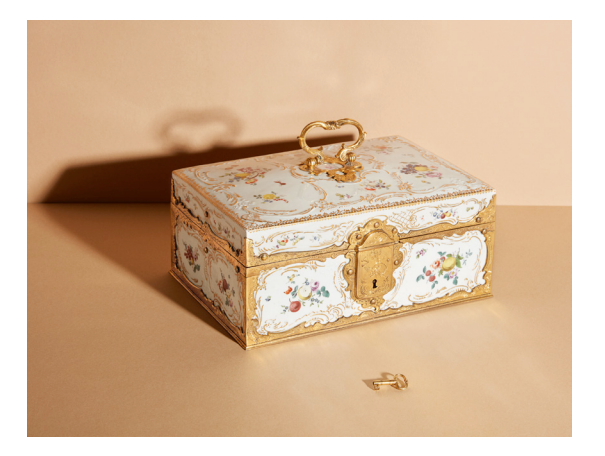
Meissen Porcelain. Flute case, possibly for Frederick the Great. 1761. Estimate EUR 250,000-350,000