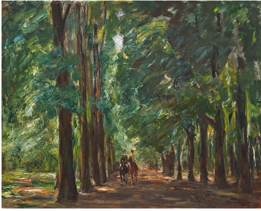
Max Liebermann. "Reiter in der Allee bei Sakrow". 1924 Sold for EUR 1,465,000 (incl. premium)