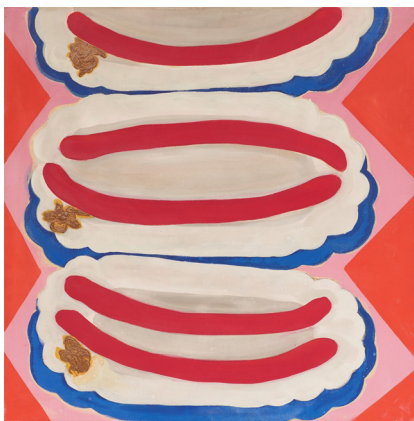
Konrad Lueg. "Bockwürste auf Pappteller". 1962/63 Sold for EUR 437,500 (incl. premium)