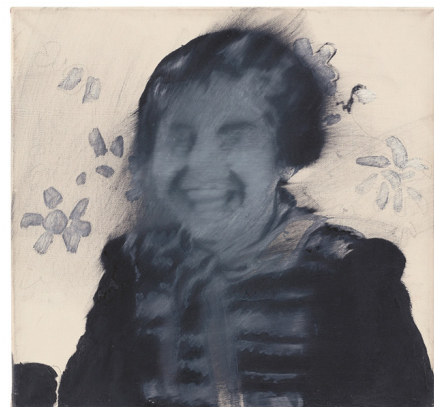
Gerhard Richter. "Heidi". 1965 Sold for EUR 550,000 (incl. premium)