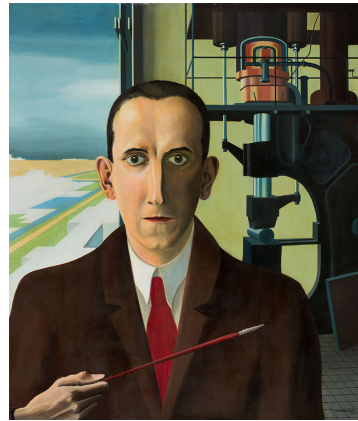
Carl Grossberg. Self portrait. 1928 Sold for EUR 649,000 (incl. premium)