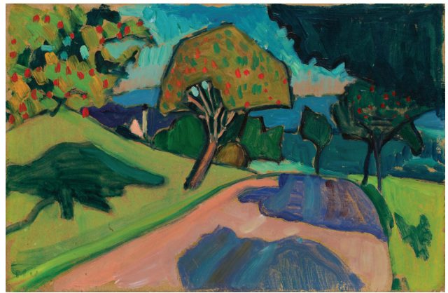
Gabriele Münter. "Kohlgruberstraße" (Murnau). 1908. Sold for 575,000 EUR (incl. premium)