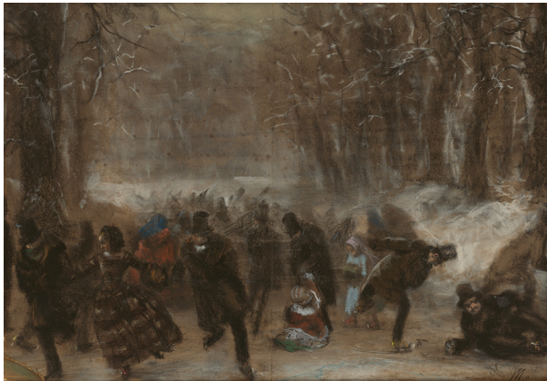
Adolph Menzel. Schlittschuhläufer. Ca. 1855/56. Sold for 312,000 EUR (incl. premium)