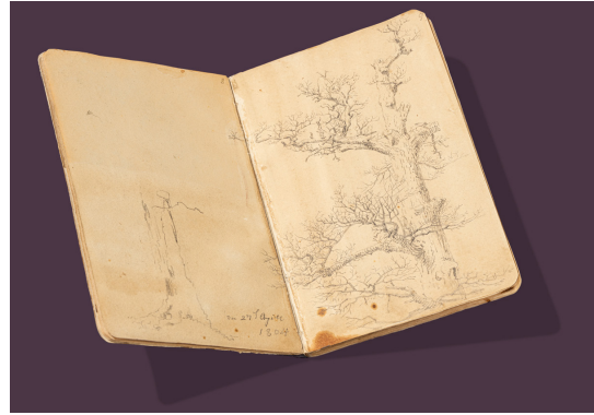
Caspar David Friedrich. "Karlsruher Skizzenbuch". 1804. Sold for 1,819,000 EUR (incl. premium)