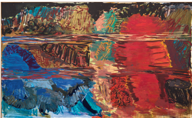
Per Kirkeby. Untitled. 2011. Sold for 444,500 EUR (incl. premium)