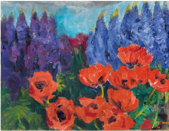
Emil Nolde. "Mohn und blaue Lupinen". 1950. Sold for 1,636,000 EUR (incl. premium)