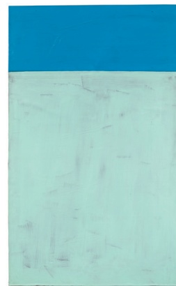
Günther Förg. Untitled. 1990. Sold for 317,500 EUR (incl. premium)