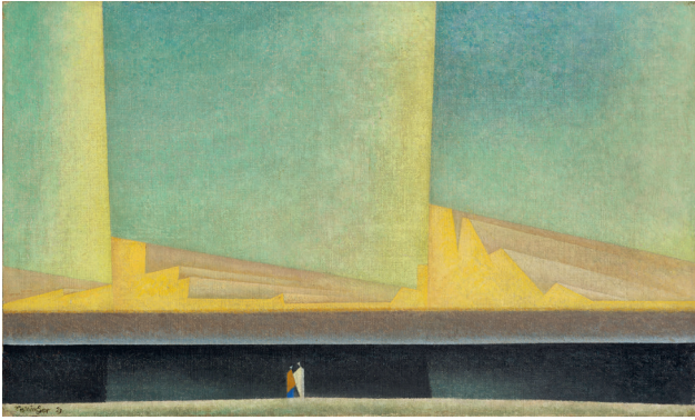
Lyonel Feininger. "Wolken überm Meer I". 1923. Sold for 2,368,000 EUR (incl. premium)