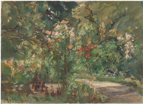
Max Liebermann. "Blumenstauden im Nutzgarten nach Nordwesten". 1929. Oil on canvas. 54 × 75 cm. EUR 300,000–400,000