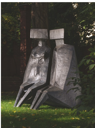
Lynn Chadwick. "Sitting Figures". 1979/80. Bronze with black patina, two-part. 188 × 88 × 125 cm; 182 × 100 × 131 cm. EUR 800,000– 1,200,000