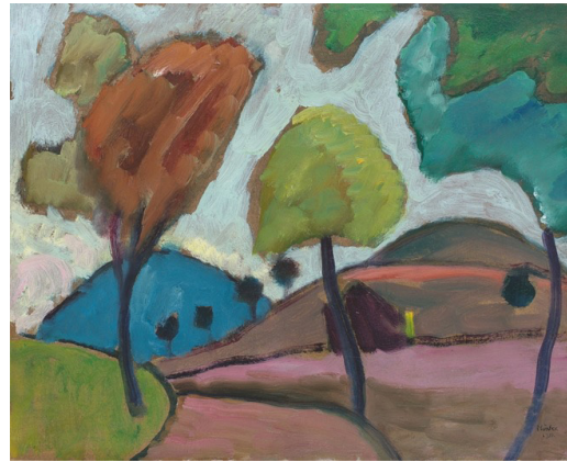
Gabriele Münter. "Herbstliche Landstraße". 1910 Oil on cardboard. 32.7 × 40.7 cm. EUR 250,000–350,000