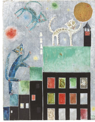
Otto Dix. "Katzen (Theodor Däubler gewidmet)". 1920. Oil and glitter on aluminium sheets on wood. 47 × 37 cm. EUR 800,000–1,200,000