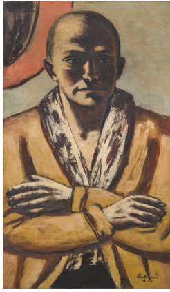
Max Beckmann. "Selbstbildnis gelb-rosa". 1943 Oil on canvas. 94.5 × 56 cm. Estimate on request