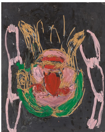
Georg Baselitz. "6 schöne, 4 häßliche Porträts: häßliches Porträt 9". 1988. Sold for € 400,000