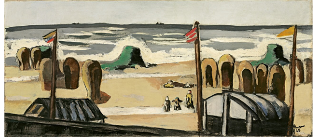
Max Beckmann. "Grauer Strand". 1928 Sold for € 1,765,000