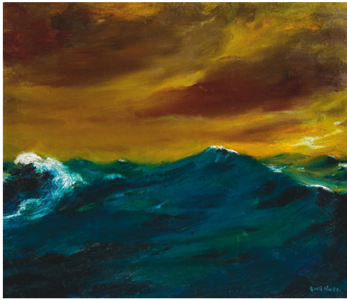
Emil Nolde. "Hohe See". 1939 Sold for € 1,585,000