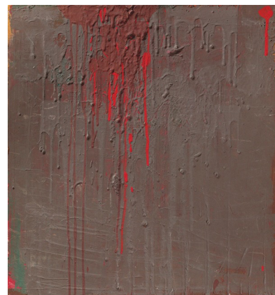
Hermann Nitsch. "Untitled (Schüttbild)". 1960 Sold for € 387,500