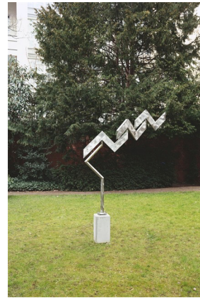
George Rickey. "Triple N Gyration II". 1988 Sold for € 475,000